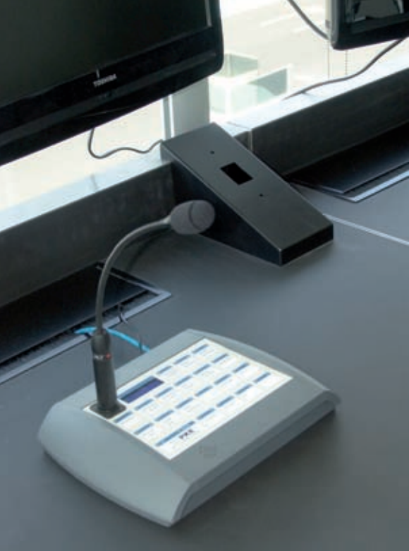
Spidermike 2 communication terminal