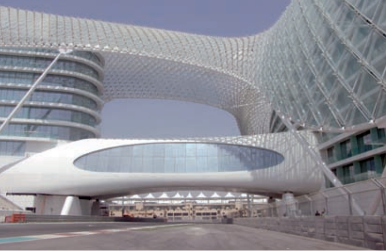
The circuit also leads straight through the "Yas Hotel"

automatic switch over to backup power amplifiers is used in the existing installation.