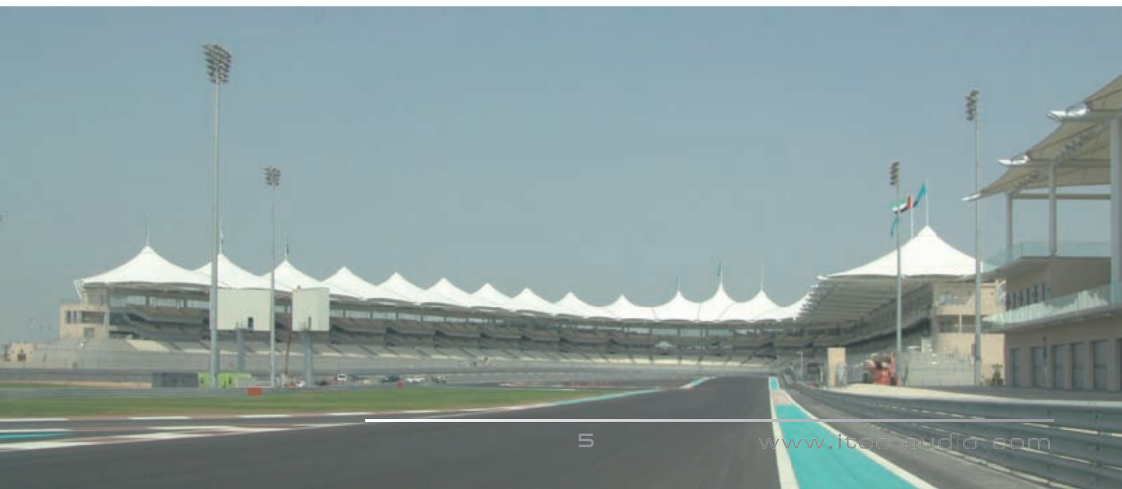
View from the circuit to the northern grandstand at the hairpin turn

The ITEC Power top 12 systems can either be mounted horizontal or vertical, the horn tweeter (90°x60°) itself is adjustable by 90 degrees in order to adapt it to individual assembly methods. The integrated passive frequency separating filter is equipped with a protection circuit, ensuring that no component is overloaded – highly important for speakers systems, which after installation are difficult to access. Especially important for an outdoor installation is the weather-