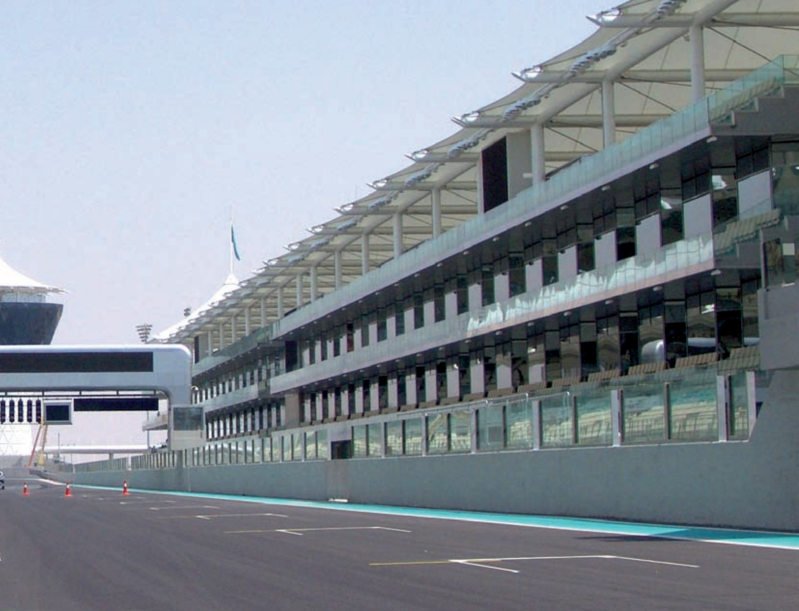
Start / Finish straight with main grandstand (on the left) and pit buildings (on the right)