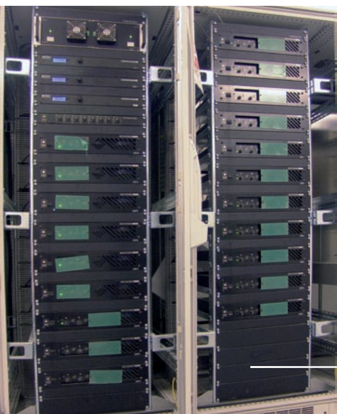
One of the numerous racks with "Spider 44" systems and power amplifiers – On the right 3 "Spider 44" systems with level regulators as mentioned within the report

The fault detecting relay outputs of the power amplifiers within one area are similar to an alarm system connected in series - during normal operation the contacts are closed. Is a relay due to a fault condition de-energized, the digital input of that specific "Spider 44", which is responsible for supervising this area, is set to logical 0. This status is visible within the entire ITEC*NET, therefore only one Spider (plus one for corrective maintenance) is sufficient, to forward all error messages within the network to the superior fault indication system. Due to the fact that low resistive power amplifier outputs require complex solutions, no