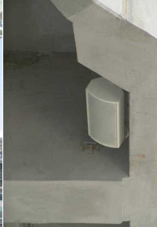
Seat area of the VIP loges (on the left) with installed delay speaker systems below the balcony: A similar installation can be found in the pit buildings (page 9)

local area terminal at the North Grandstand allows only announcements within that specific audio area.