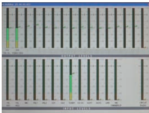
The level indicators display the actual power output levels at the whole circuit