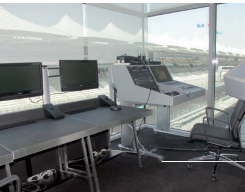
The workplace of the commentator is located right at the "Start / Finish straight" (on the left) Console terminal of commentator (on the right)

For the commentator himself, two headsets with wireless microphones and a cable based version are available. Furthermore, two wireless hand-held transmitters, which allow him due to the usage of multi-diversity wireless microphone solution, to operate in the area of the main pits (e.g.: for carrying out interviews directly in the boxes). Beyond that he can use two local replay machines and is able to access two ITEC NET network channels, which are already pre-programmed with a broadcast tuner and a fivefold CD changer. On his transmission rack he can make use of different PFL (Pre-fader listening) functions for the individual channels (realized by a 6x ITEC multimixer). With this, he is able to create his own mixing and feed it into the audio network. He can also make use of 16 faders, allowing him the adjustment of the sound volume in 16 different speaker areas outdoor (tribunes, VIP areas). The background of using this approach is the fact that for smaller race events not encompassing the entire circuit, a sound emission is required, but only within distinct areas.