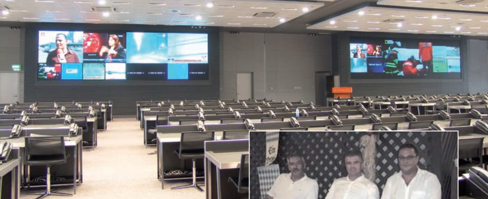
View of the large process conference room within the "Media-Center" equipped with 3 large "Barco" projector systems – the sound is provided by ITEC ceiling speaker systems