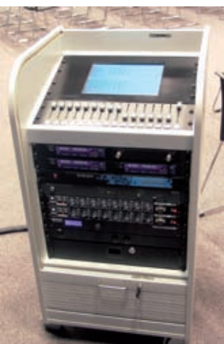
Mobile media rack in the press conference room (on the left), View of the press conference room with installed "Powerline" speaker systems (on the right)

Per output, the signal is available to XLR, and 3.5mm jack plugs, allowing the connection of most of the portable recorders as well as of audio inputs of cameras. In parallel a low signal is brought in to a speaker box located on the ground, allowing the use of voice recorders, which are equipped with a built-in microphone and having no line-in connection. For live broadcast of public-addresses, the room is equipped with 4 Powerline-2 speaker systems, which are installed at the side walls. Local broadcasting is carried out by a mobile mixer system which is linked to signal sources and signal drains in the hall, and further to the ITEC*NET by a signal divider on the ground. The reason for using this mobile solution was that there is no control cubicle, and the room itself is not always used for one-way meetings. 6 microphones on the pedestal use the automated microphone mixer of the ITEC Multimix. This mobile feeding rack with an integrated mixer also allows operation of a press conference in manual mode.