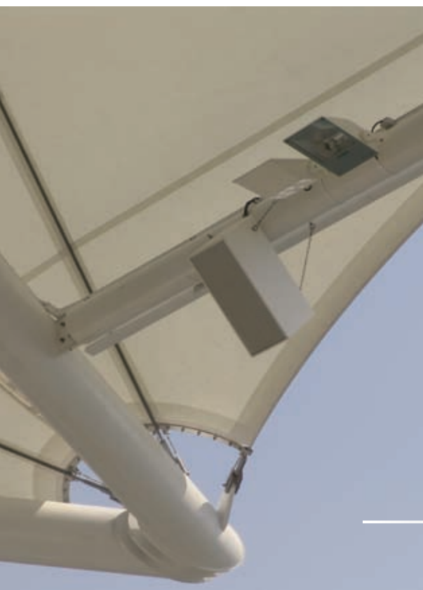
ITEC Powertop 12 speaker system