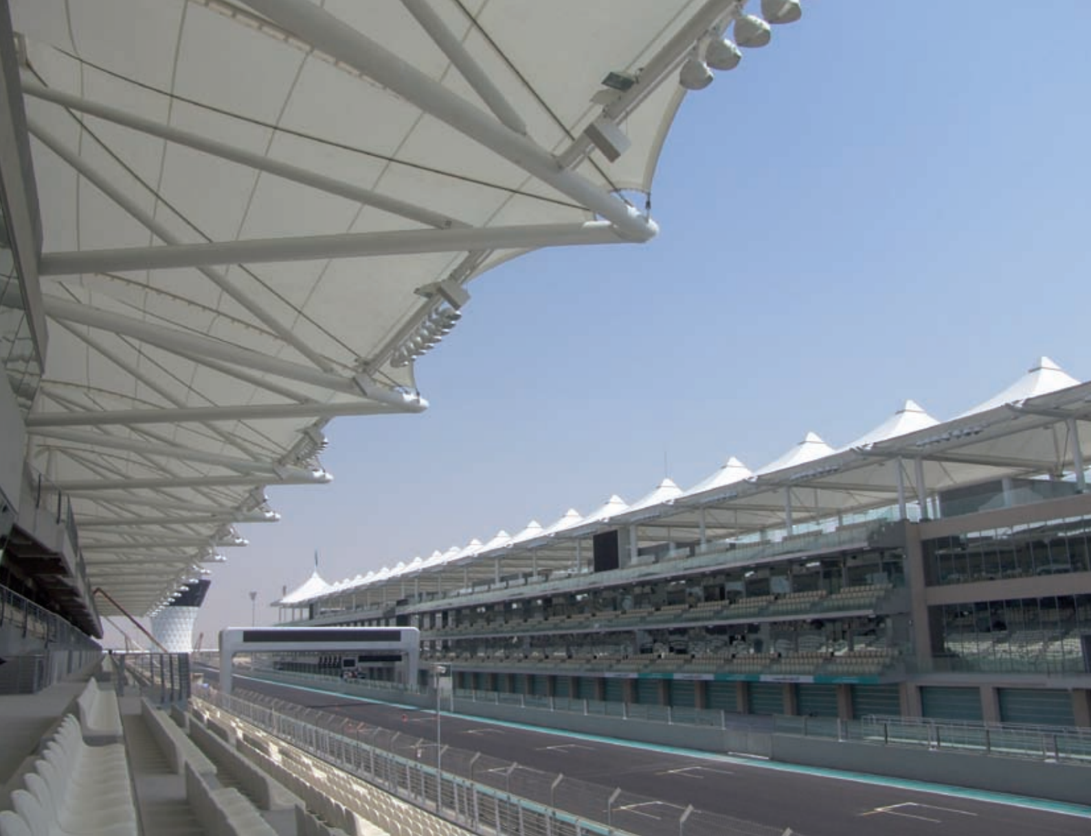
View from the main grandstand to the pit buildings across

It installs and integrates electro-technical building facilities, management and communication systems, alarm and automatic fire detection systems, video equipment, access control systems as well as recording and evacuation equipment.