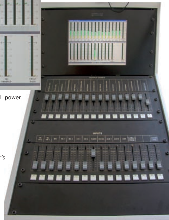
Operating interface of the commentator's console terminal

The aforementioned PFL function is realized within four digital ITEC Multimix systems. Two of them are accessible from the user interface, allowing the commentator to adjust the gain levels for different signal sources in order to achieve approximately the same output level at identical fader positions. The possibility to adjust the output levels of different sound areas from the operator console by the commentator is a function of the ITEC audio network by default. The configuration allows for each single output like Spider 44, or Spider Mike, to determine from which entity within the network the levels for the output signals are taken. That can be on one hand a local device like the Spider itself, where the output is located, on the other hand it could also be from one of the other network participants. To realize a fader regulation, for example the analog control voltage input at each Spider can be used. When adjusting the output you can then determine either to use the input of a local voltage regulator or to take the information from a different device within the network, deriving the necessary information for the regulation from the voltage control inputs present at that device. In this way a remote adjustment of the output level is also realized: The different speaker zones along the circuit obtain their output levels from the specific Spider 44,