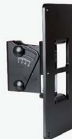
Pan / tilt bracket